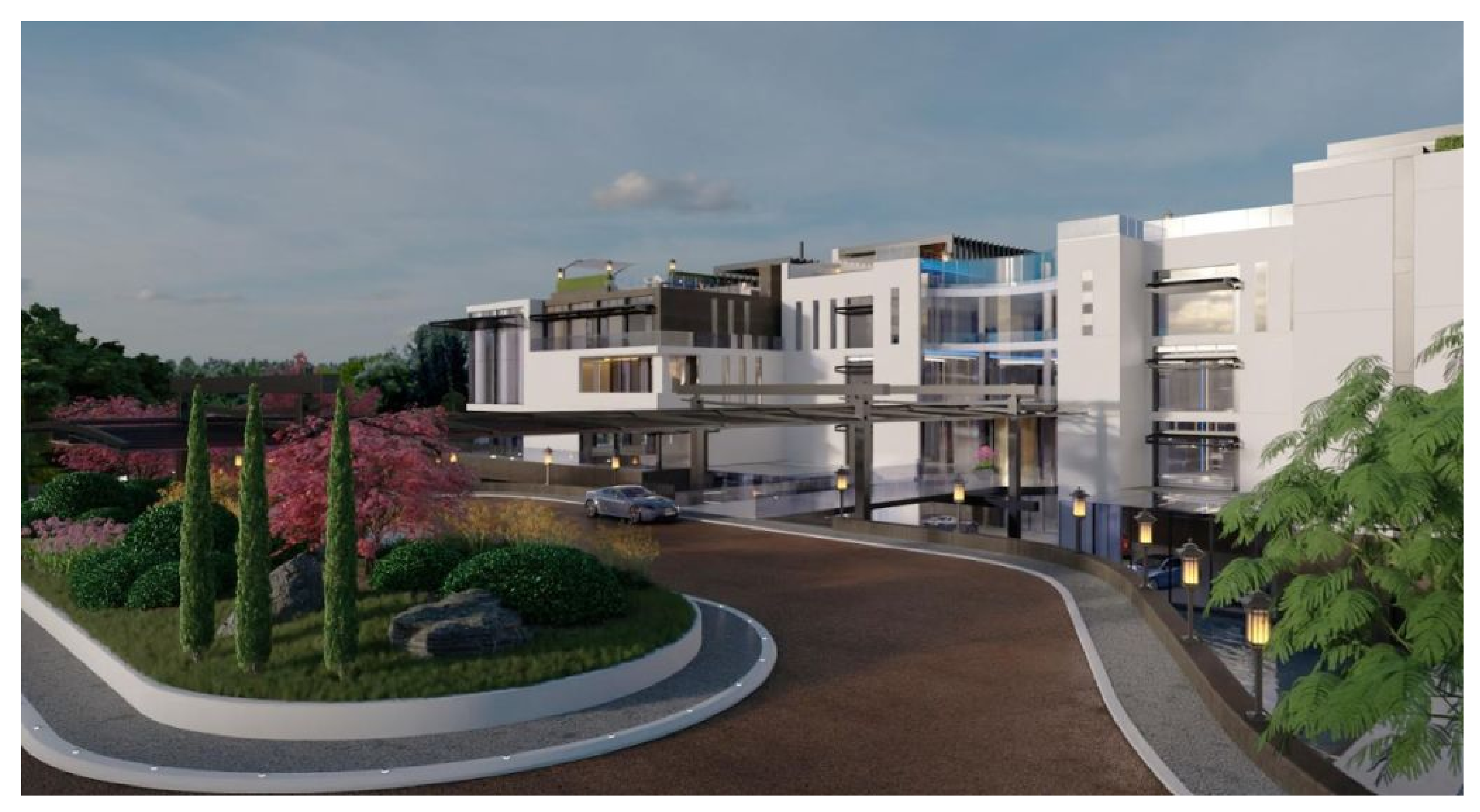
The 26-room residence is located about an hour's drive from Perth.

Not one but four kitchens are designed for specific cuisines and will complement the impressive four-storey wine cellar.