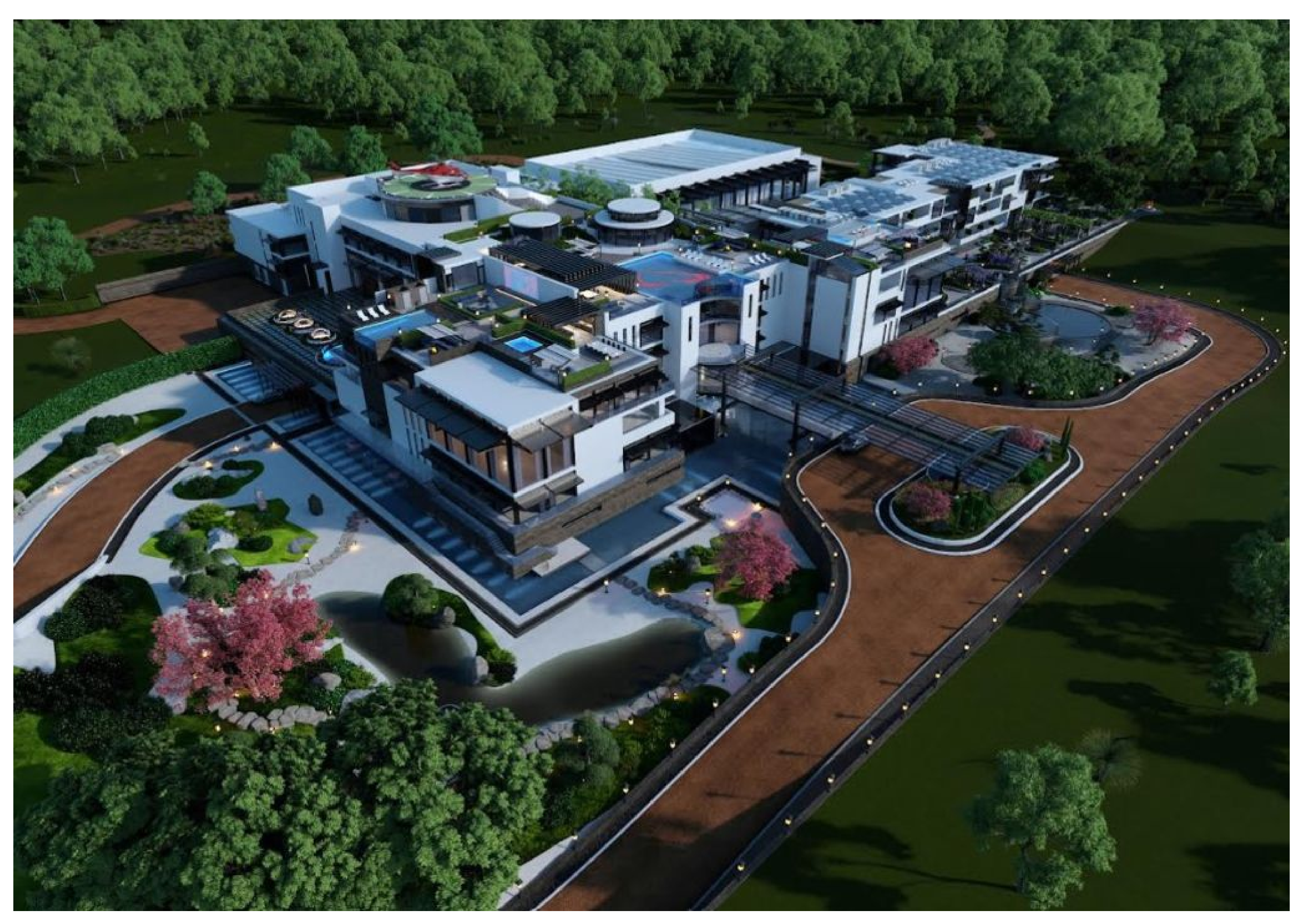
Chittering Manor is Australia's most expensive ever residential build at $200 million.

Chittering Manor is expected to be completed in three years and will be Australia's most expensive ever residential build.