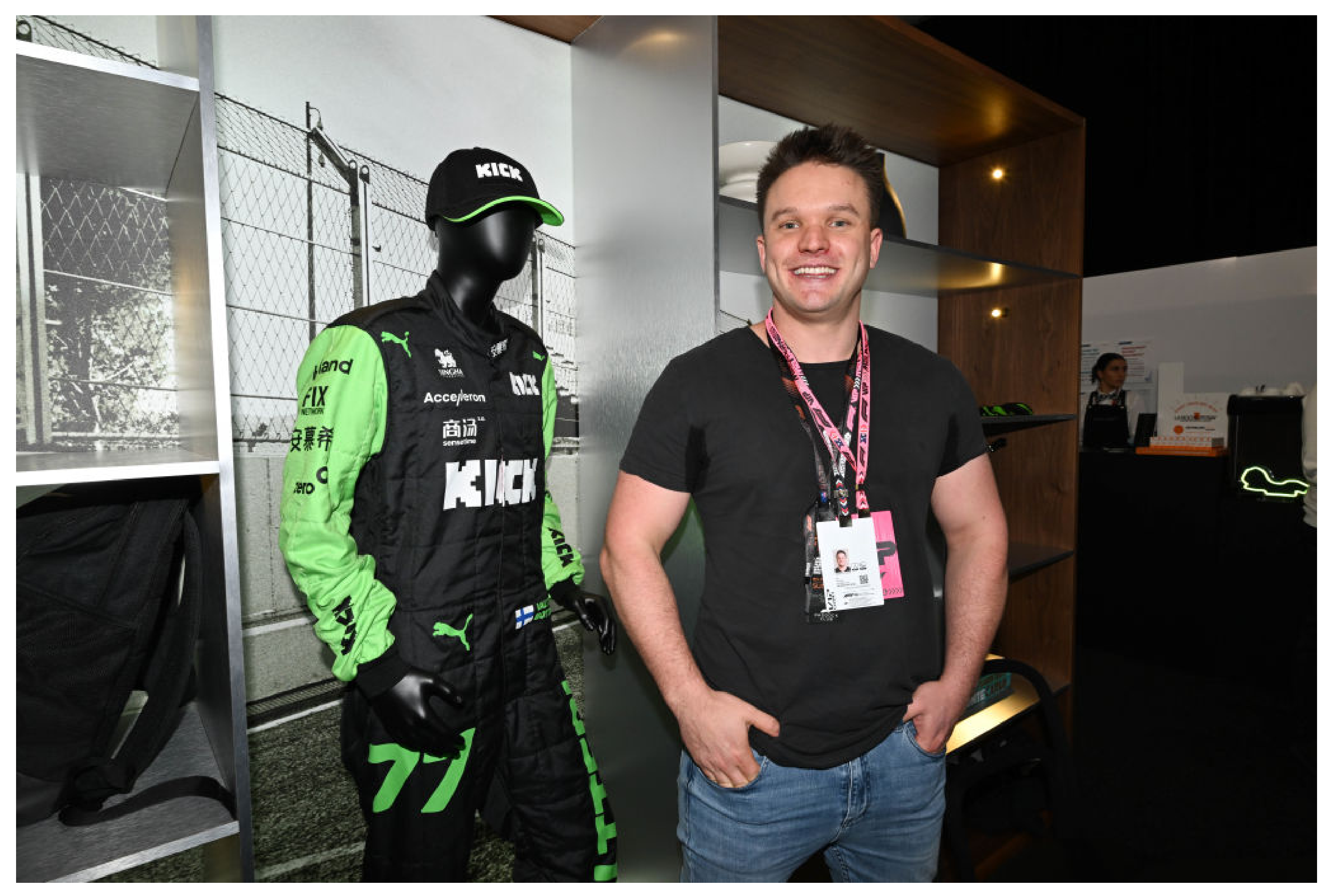
The manor surpasses the value of Ed Craven's $145 million Toorak build.

The manor sets a new benchmark for the prestige real estate market, surpassing the value of Ed Craven's $145 million residence in Toorak, on a block he paid $88 million for two years ago.