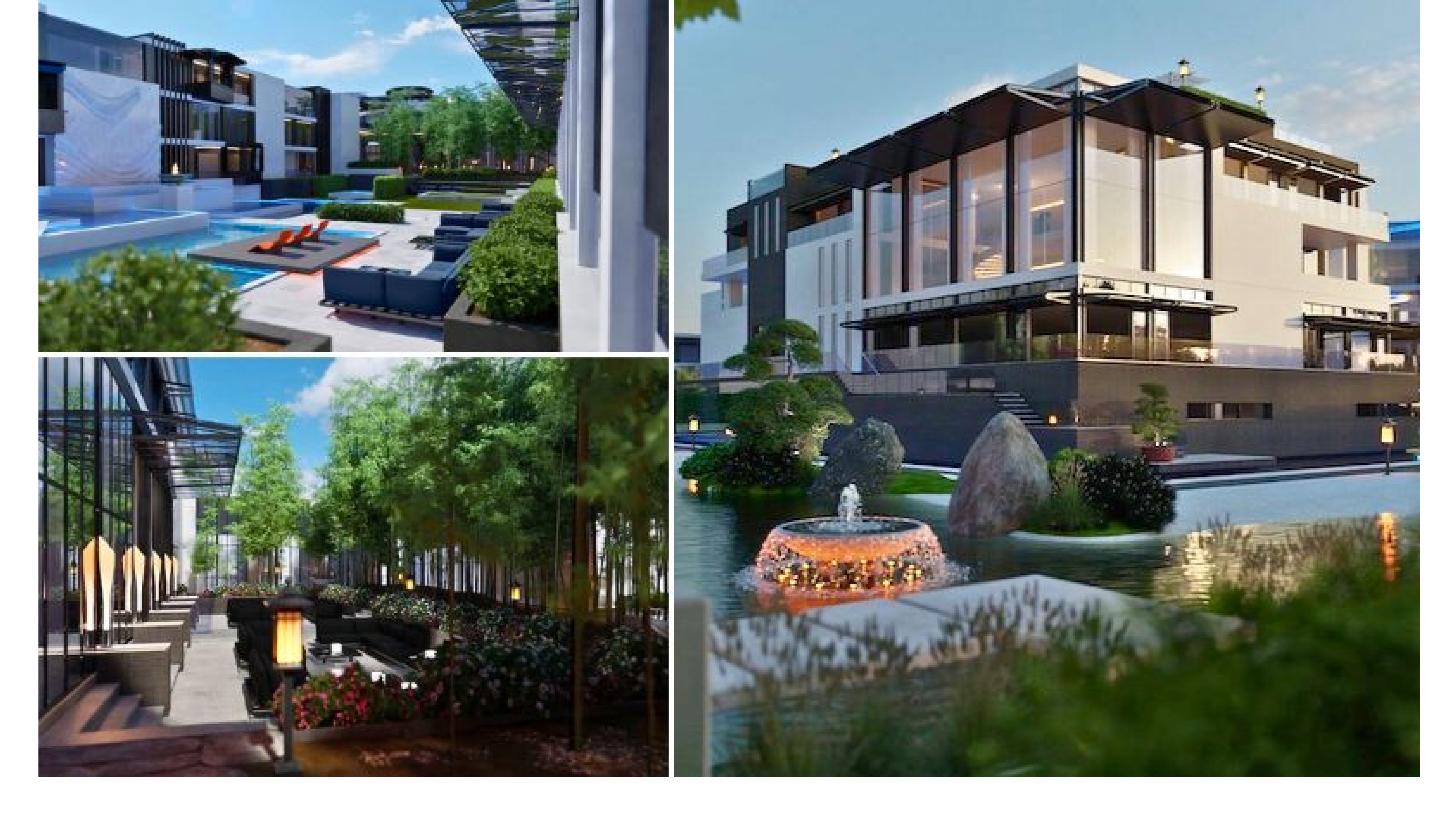
▲ Renders of the 26-room mansion approved south of Perth.

The project construction value has been estimated at $200 million. It has been approved by the Shire of Chittering.